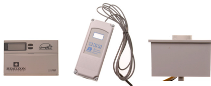
Various Activation Devices