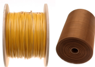
Tuff Cable & Z Mesh Element